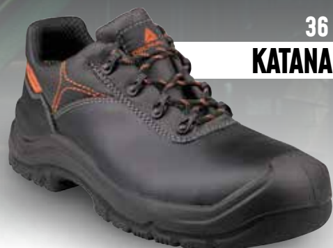
36 ▶ 48 KATANA EH