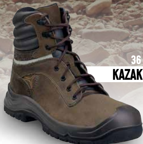
36 ▶ 48 KAZAK EH