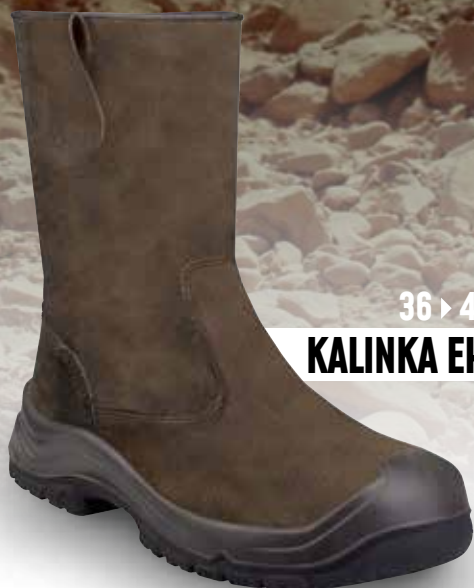
36 ▶ 48 KALINKA EH