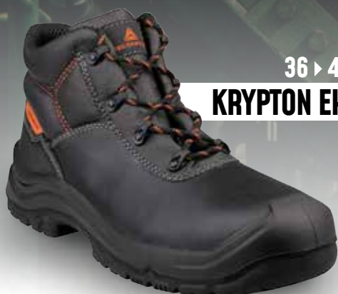
36 ▶ 48 KRYPTON EH

INDUSTRIAL MAINTENANCE - OILY ENVIRONMENTS - WARM SOILS