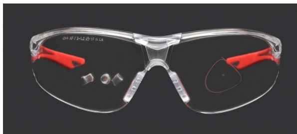
Ballistic vs. ANSI

7x ANSI Z87+ Energy 4x Z87+ Impact Velocity