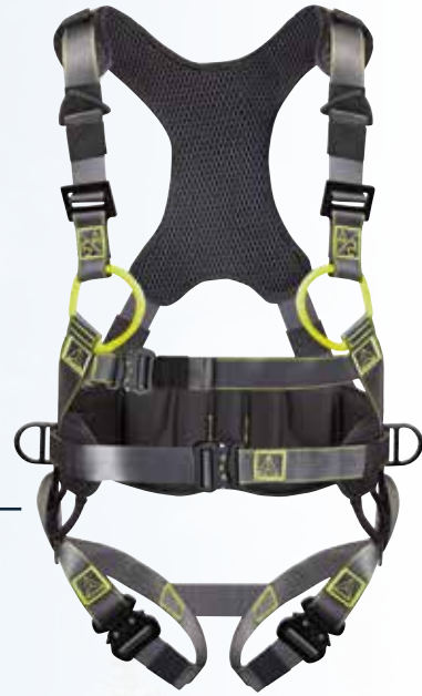
HAA35M S/M/L XL/XXL

Two colour harness with positioning belt. 2 fall arrester attachment points (back - front). 5 adjustment buckles, including 3 automatic buckles and 2 irremovable buckles. Positioning belt with thermocompressed back. 120° rotation. 2 work positioning anchorage points (lateral). 1 restraint anchorage point (back). Soft padding on shoulders.