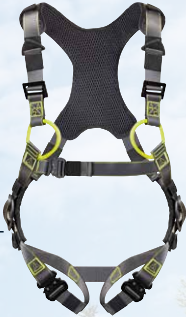
HAA32M S/M/L XL/XXL

Two colour harness. 2 fall arrester anchorage points (back - front). 5 adjustment buckles, including 3 automatic buckles and 2 irremovable buckles. Soft padding on shoulders and at the pelvis level.