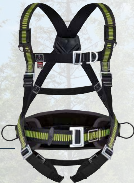
HAA24 S/M/L XL/XXL

Two colour harness with positioning belt. 2 fall arrester anchorage points (back - front). 6 adjustable buckles. Positioning belt with thermoformed back. 2 lateral anchorage points for work positioning.