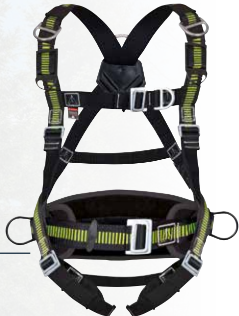
HAA26 S/M/L XL/XXL

Two colour rescue harness with positioning belt. 2 fall arrester anchorage points (back - front). 6 adjustable buckles. Positioning belt with thermoformed back. 2 lateral anchorage points for work positioning. 2 D rings on shoulder especially for rescue. 2 park lanyards.