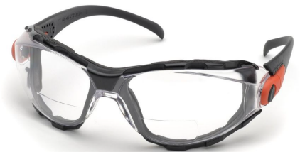
RX Clear Anti-Fog