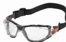
Clear AF Strap