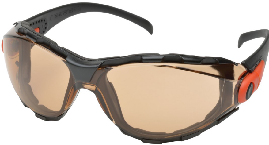
50% VLT Copper Anti-Fog Blue Blocker

Offers "goggle-like" protection with excellent comfort and wide field of vision.