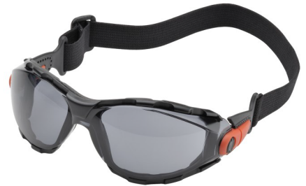
Grey Anti-Fog Strap