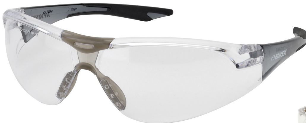
Clear with Black Temples

Our “flagship” unitary lens safety glasses with premium comfort and performance.