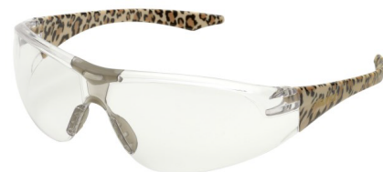
Clear with Leopard Temples