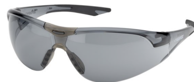
Grey Anti-Fog with Black Temples